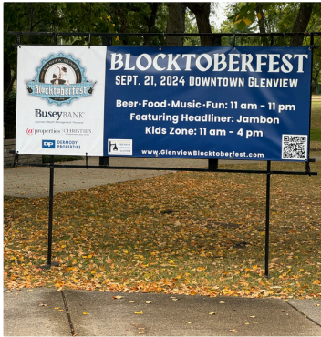
Promotional Banners around town