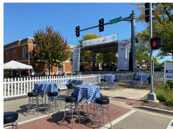
Premium Views of Church St. Main Stage Be part of the action without being part of the crowd