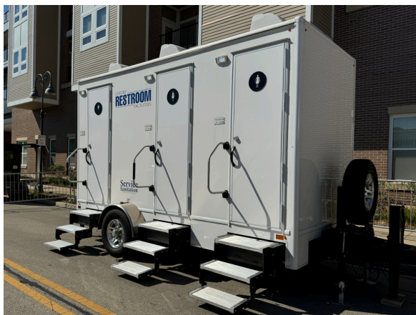
Deluxe Air Conditioned Restrooms