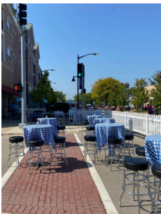
Exclusive High Top Seating

Our VIP Sponsor Lounge Space offers exclusive premium views of the bands, complimentary food and drinks (in a 1/2 liter Blocktoberfest mug), fast access to beverages, deluxe restroom amenities, and Blocktoberfest merchandise.