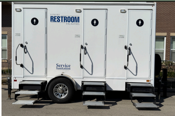
Deluxe Air Conditioned Restrooms