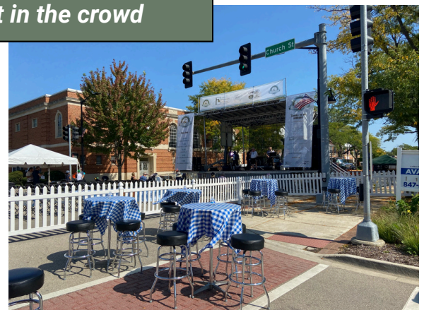
Exclusive High Top Seating with premium Views of Church St. Main Stage