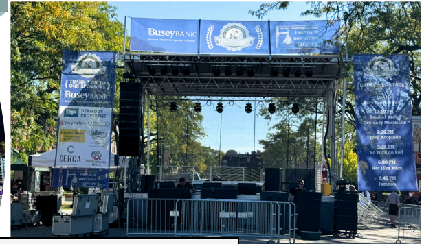
Stage Signage front and center for an audience of thousands!