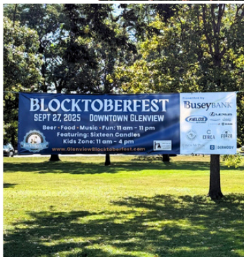
Promotional Banners around town