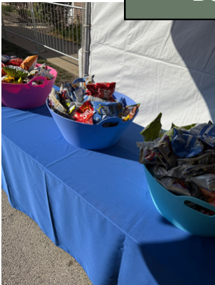
Complimentary snacks & drinks

Be part of the action without getting caught in the crowd